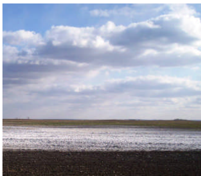
BEFORE GFT SALT DETOX TREATMENT Photo taken March, 2006

The specific laboratory report for the soil being treated is given in Attachment 2. Note comments of analyst concerning the likelihood of successful crop growth.