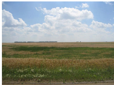
AFTER GFT SALT DETOX TREATMENT Photo taken August, 2008